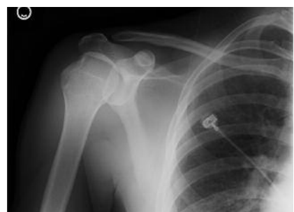
Dislocated shoulder and shoulder realigned