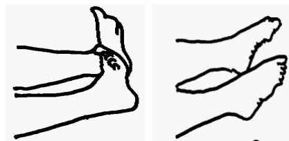
Flexing the Foot Pointing the Foot