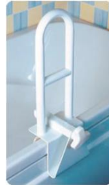
Bathtub Grab Bar