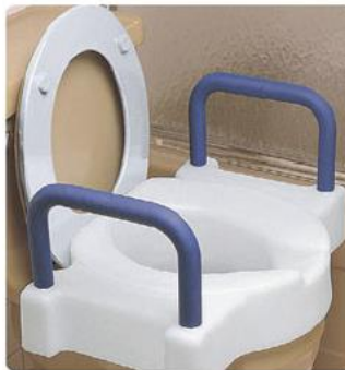
Raised Toilet Seat