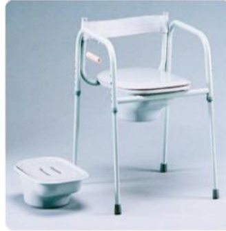
3 in 1 Bedside Commode