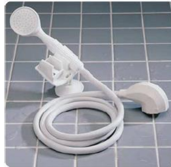
Hand Held Shower